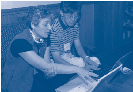
Spirited interactions and networking are important aspects of the popular Beeson annual meeting.