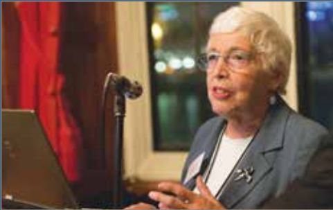
Baroness Gould of Potternewton greeted guests.