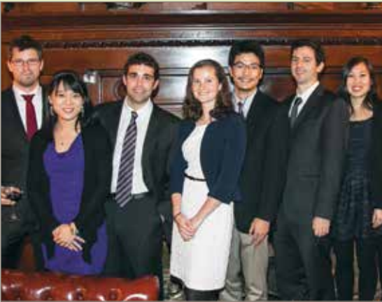
MSTAR (Medical Student Training in Aging Research) program students joined supporters at the dinner.