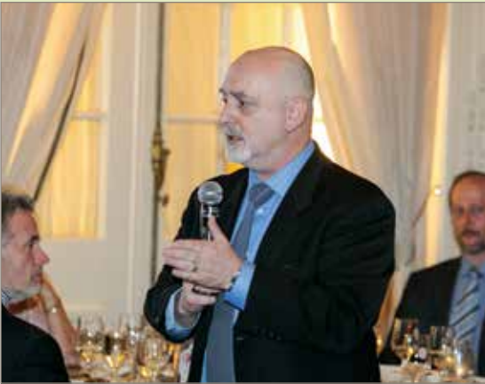
Board member S. Jay Olshansky shared insights on the socioeconomic impact of aging research.