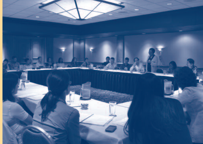
2009 Beeson Annual Meeting